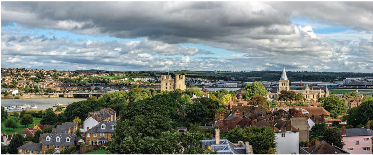
SOME OF OUR DEVELOPMENTS DELIVERED IN 2019