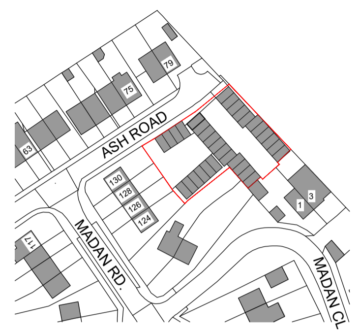
LOCATION PLAN Scale 1-1250

NOTES 1 THIS DRAWING IS PROTECTED UNDER COPYRIGHT AND IT SHALL NOT BE REPRODUCED IN WHOLE OR PART WITHOUT PRIOR EXPRESS PERMISSION OF ARCHITECTS PLUS LIMITED 2 DO NOT SCALE DIMENSIONS OFF THIS DRAWING CHECK ALL DIMENSIONS ON SITE BEFORE FABRICATION ALL DISCREPANCIES TO BE REPORTED TO THE ARCHITECT 3 ALL MATERIALS AND WORKMANSHIP TO BE IN ACCORDANCE WITH ALL CURRENT BRITISH STANDARDS AND CODES OF PRACTICE STATUTORY AUTHORITY AND MANUFACTURERS RECOMMENDATIONS AND SPECIFICATIONS